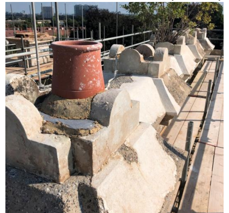
Decorative chimneys before repairs