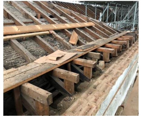
North roof, Small Mansion opened up

A wide vehicle opening with a concrete lintel was cut into the wall after it became a public park; this is the main gate to the College. Parts of the wall need major repairs which include strengthening