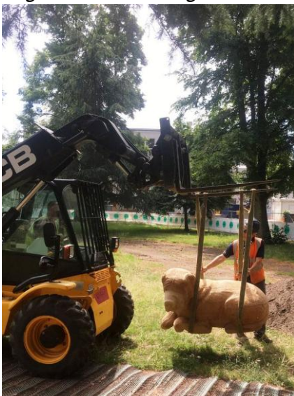
The mastiff en route to the Café

In the Large Mansion work is progressing on the plasterwork using colour schemes based on an analysis of surviving historic paints. New benches and bins have been installed. Work on the Round Pond and Temple has been completed and the fencing there has recently been removed.