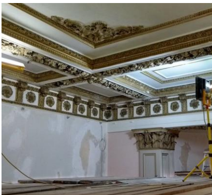
View from the scaffolding platform, Large Mansion Drawing Room

Since Newsletter 106 a great deal has been happening on site. There is no substitute for walking round! Regular Twitter updates and photos appear on @gunnersbury1 and news on visitgunnersbury.org . Unforeseen problems with the Large Mansion have caused delays and increased costs so the Project Team has now asked the Heritage Lottery Fund for additional grant funding. Elements of the work in the Park are opening gradually, while the Museum and newly-built Café will be launched in spring 2018.