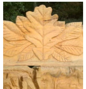
Nature trail seating