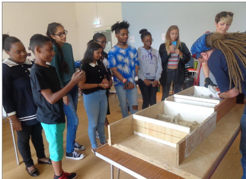
Demonstrating mould making and plaster casting, Bronze Arts Award

Their theme of Metamorphosis encouraged participants to reflect on the changes taking place at Gunnersbury. They produced sculptures and other artwork inspired by the Large Mansion's architecture and interior design and by the Park's natural heritage. These were shown in the Lost Tennis Court and the Large Mansion at September's Open House.