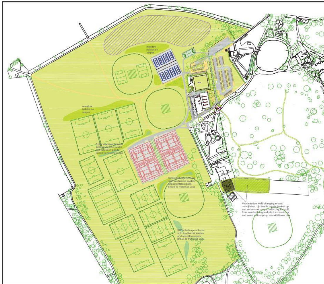
Landscape Masterplan from The Design & Access Statement showing the siting of the artificial grass pitches (red, in the centre) and the tennis courts (top)

Enlarged Car Park There are currently 130 spaces in the main car park, in two areas, one tarmac and the other a “grasscrete”-type cellular surface). Another 153 spaces will be added by taking over the PHS/Greenscene site behind the walls. The existing entrance/exit at Popes Lane is deemed to be wide enough for two cars to pass and it is not possible to change it because of the boundaries.