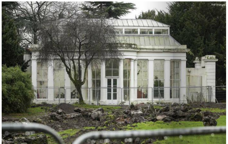
Metal mesh barriers in place around the former Horseshoe Pond

With the arrival of the contractors and works getting underway, scaffolding now covers the Large Mansion, substantial hoardings surround the works to ensure safety and the big iron gates on Popes Lane are closed. The nearby pedestrian gate facing the North Circular is the best alternative way in. It is disappointing that the hoped-for notices, to keep Park users informed, have not materialised.