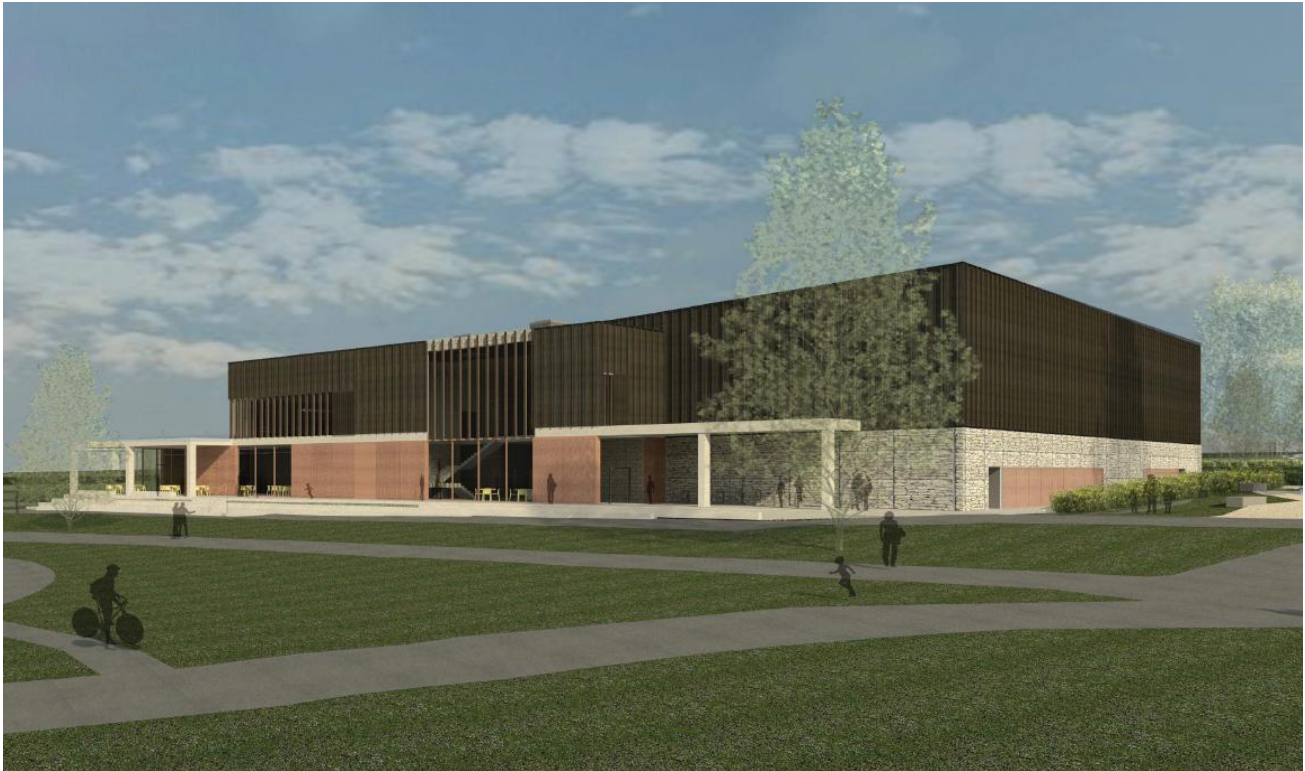
Looking north from the Children's Playground (AFLS+P Architects)