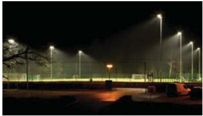
Modern floodlighting on a recent and similar development to show very limited light spillage outside the playing area

Fencing and lighting The open field will have three, possibly four, fenced areas, two with floodlighting. The tennis court fencing will be 3-metre (10ft) high green plastic-covered chain-link with 15 galvanised column lights each 8-metres (26ft) high. The artificial grass pitches will have 4.5 metre (15ft) high fencing with 9 galvanised column lights, all 13 metres (43ft) high. The Multi-Use Games Area (MUGA on the plans) will have 3-metre high green chain link fencing, but does not appear to be floodlit. There are also plans for the golf course to move to the top of field, and this site will presumably be fenced as well, but the golf course proposals are not included in this planning application.