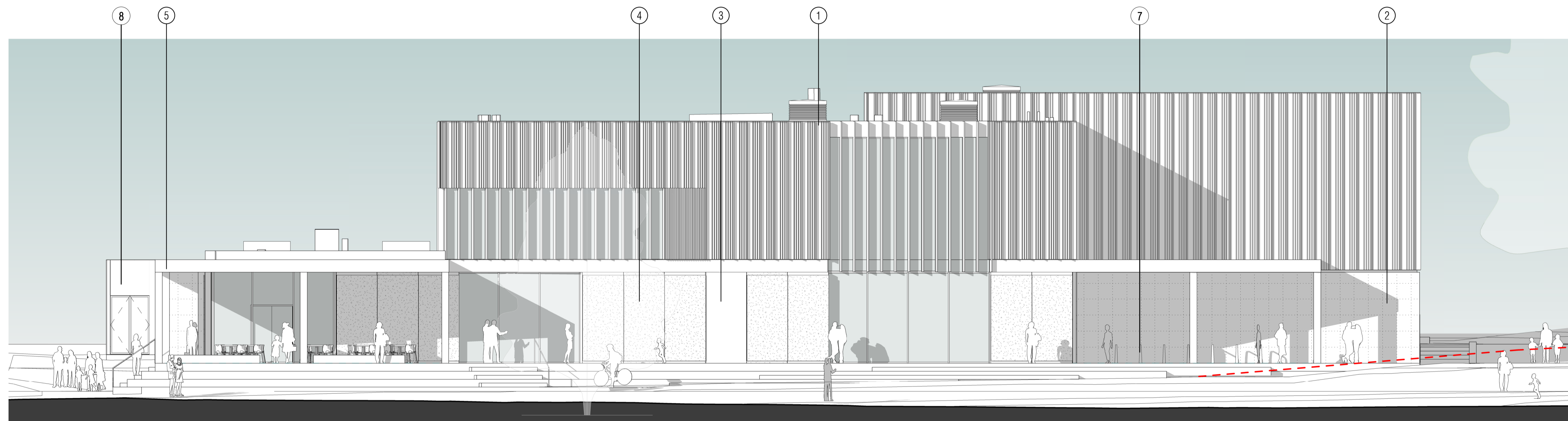
South Elevation 1:100