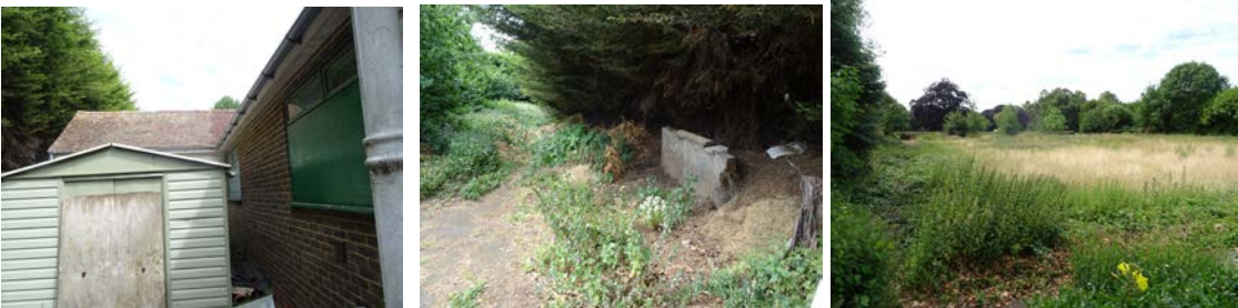
Figs. 1-3: Rear of the Bowling Pavilion; compost area between the Oak and Lleylandii hedge; and naturalised grassland habitat.